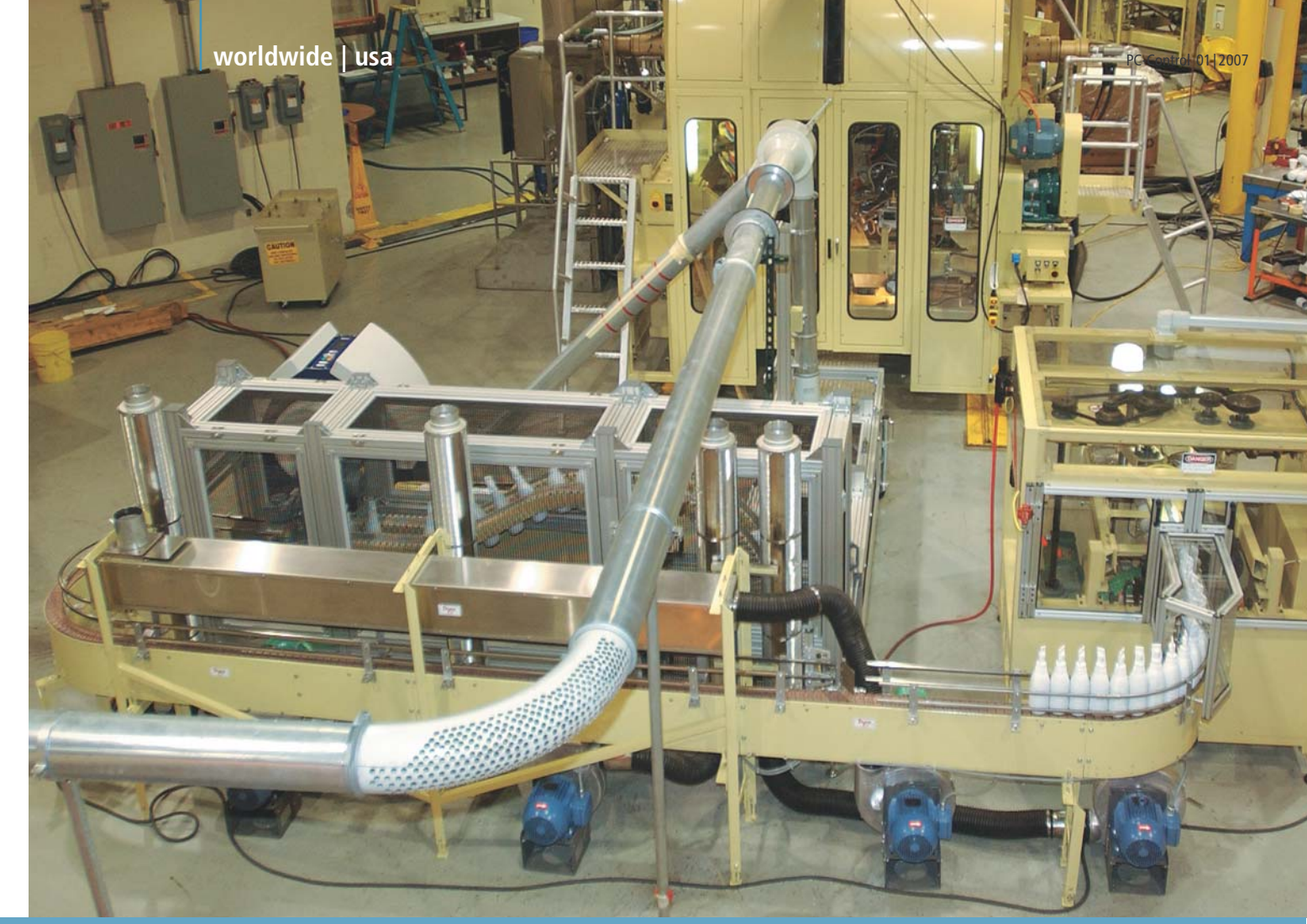
Graham Engineering Corporation (GEC), located in York, Pennsylvania, specializes in high-end blow molding machinery and equipment for the non-PET segment of the fluid bottling and packaging market. Their machines are widely used at plants that manufacture bottles to be filled with automotive fluids, household detergents and cleansers, and beverages that are marketed in non-transparent bottles. By using the PC-based control system from Beckhoff and the ultra fast EtherCAT fieldbus system, they were able to significantly increase the productivity of the machines and the quality of the molded bottles.