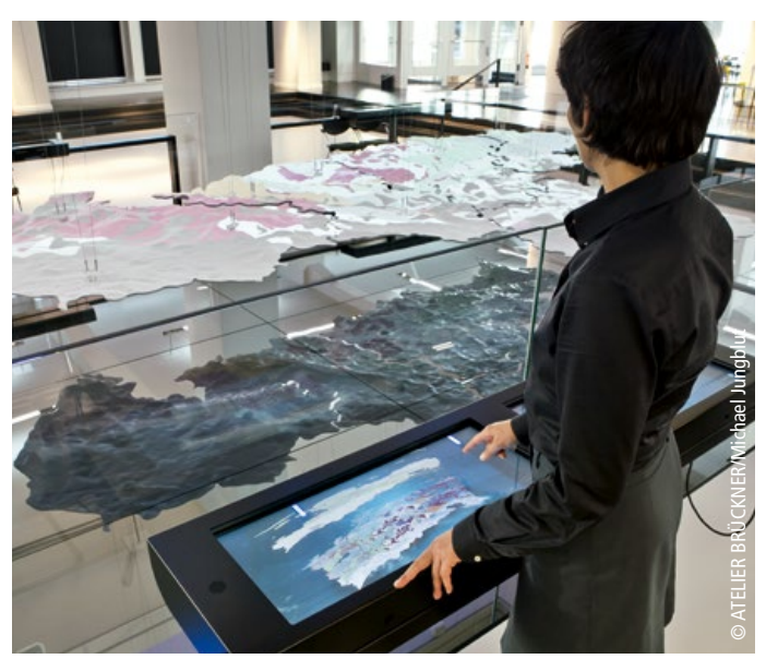
When the sculpture is not in show mode, it is positioned on the ground floor, so that visitors can interact with it and search for clues. Eight touchscreens can be used to call up information on the archaeology, as well as the cultural and economic history of the Free State of Saxony. The display can be transferred from the monitor to the Saxony model.

through the vertical air space of the museum once per hour. It forms a narrative bracket and a link for the exhibition content on the individual floors, a 'memory machine' that sends us on a poetic journey through 300,000 years of Saxon history," according to Charlotte Tamschick, Creative Director of TAMSCHICK MEDIA+SPACE, referring to the multimedia aspect of the kinetic installation.