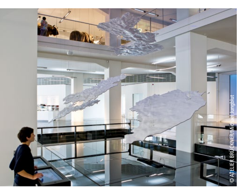
The "slabs", which represent a projection from above and below, move into the light cone, and dynamic projection mapping ensures that the sharpness of the image is precisely adjusted, according to the axial movement.